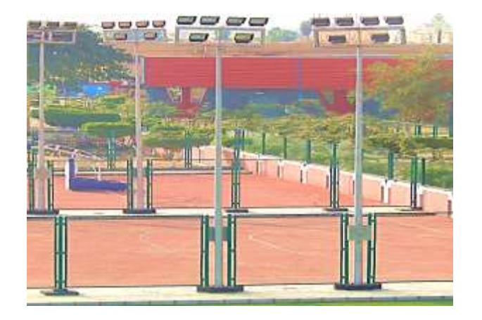
High Mast Poles