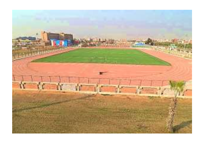
Main Court and Track