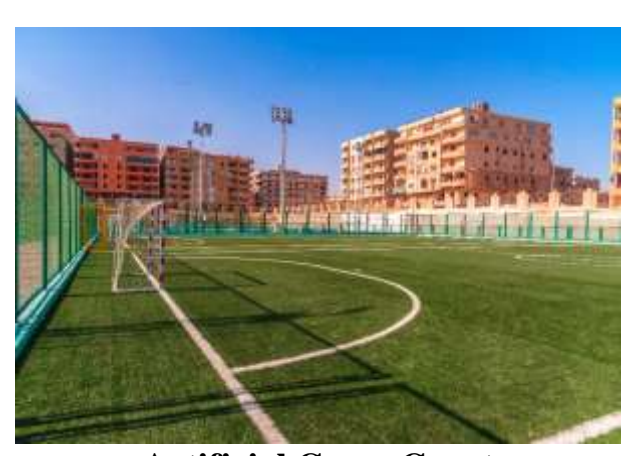
Artificial Grass Court