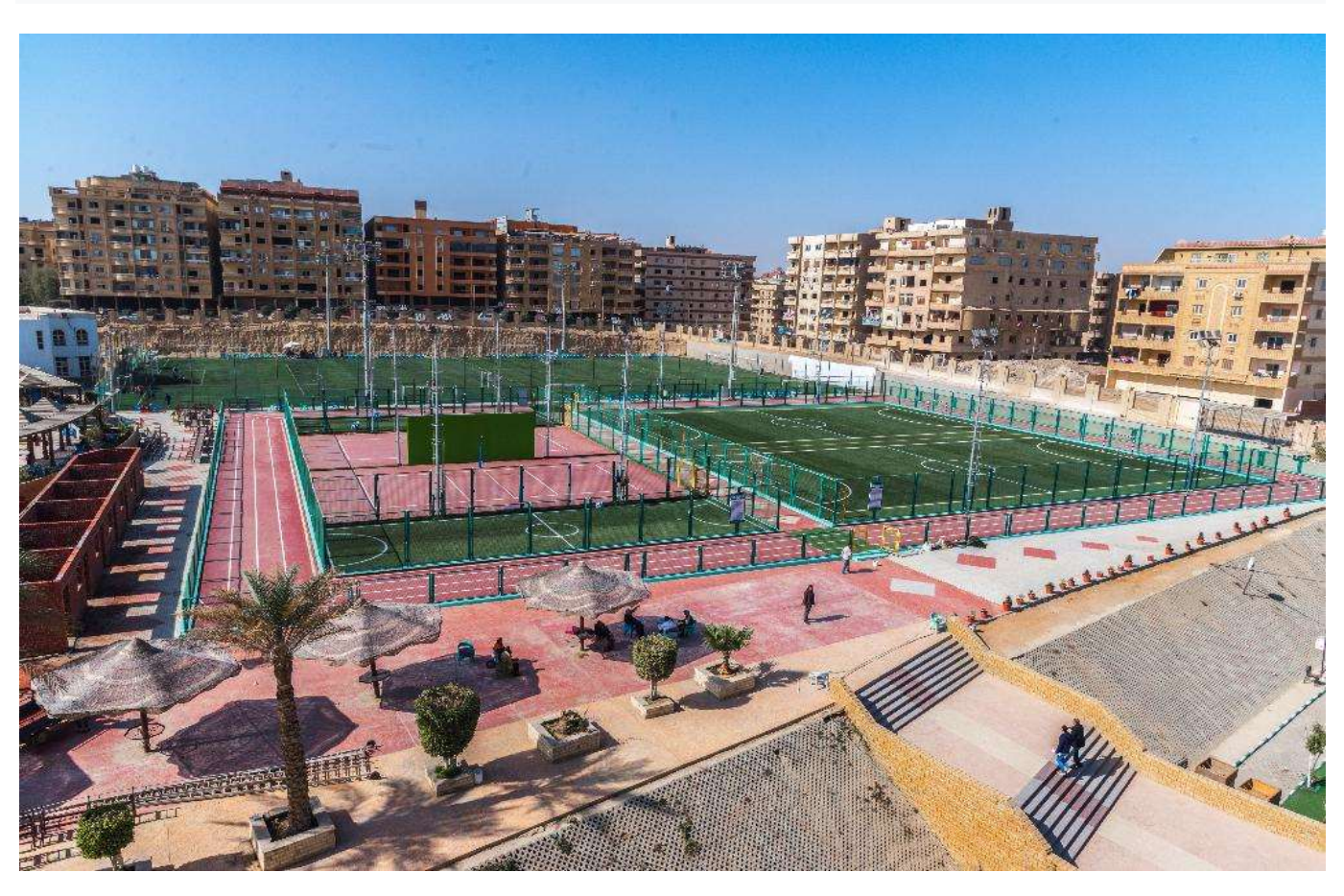
General View for the Project