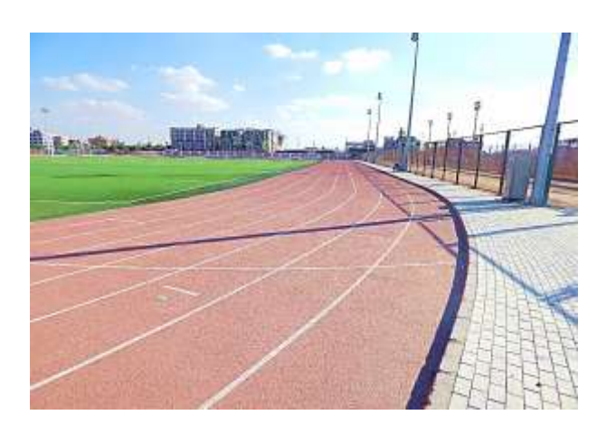
8 Lanes Running Track