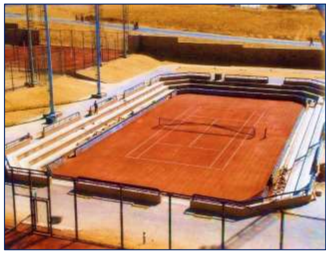
Page 2 of 7